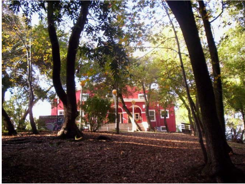
Exterior of building