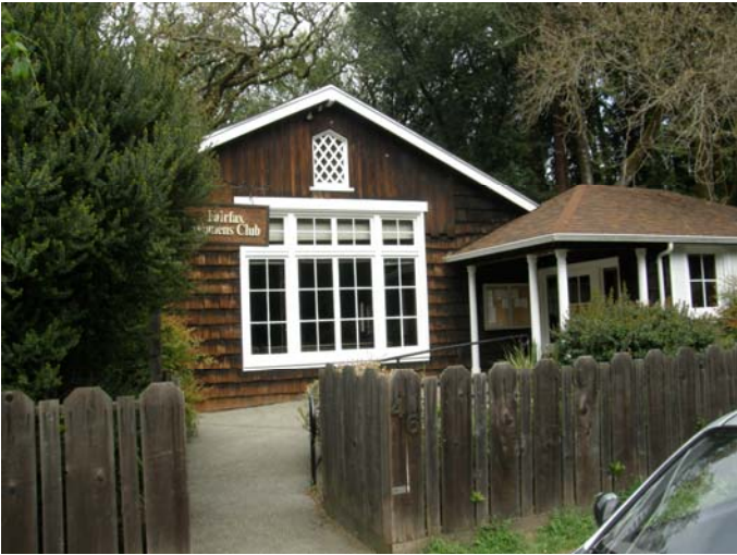
Exterior, front of building