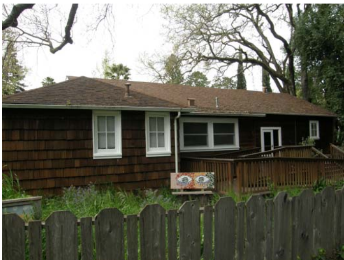
Exterior, patio area